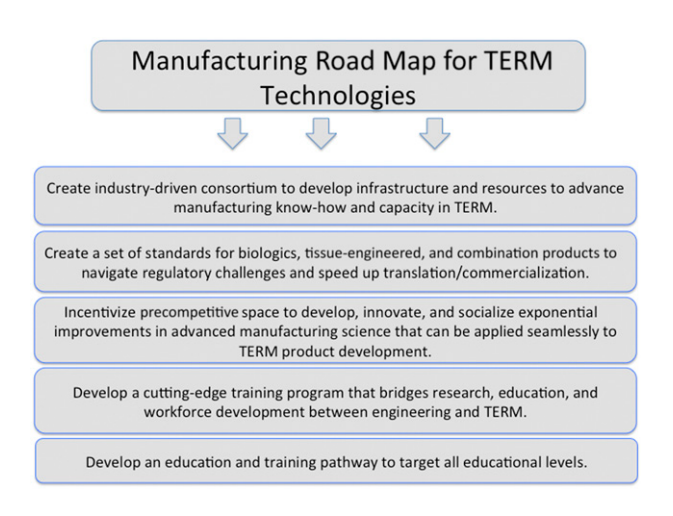
Figure 3. Manufacturing road map for TERM technologies. Depicted is an envisioned road map that will help address current manufacturing challenges plaguing the field. Abbreviation: TERM, tissue engineering and regenerative medicine.

nurtures training programs spanning kindergarten through high school and at the undergraduate, graduate, postgraduate, and professional levels.